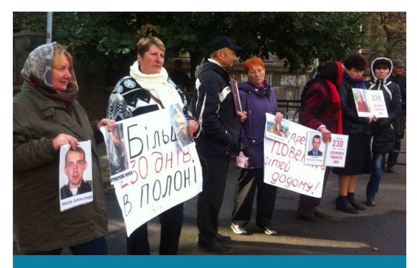
Mothers of prisoners and missing picketing at the Presidential Administration, 29 September 2015

In the process of implementing the provisions of this law, if adopted, there may appear tasks the fulfilment of which goes beyond the criminal process. This would, for example, be the case with maintaining a register of missing persons, issuance of relevant documents to relatives, appointment and payment of financial assistance to relatives of the missing persons, etc., which obviously cannot be assigned to a broad and indefinite circle of competent authorities, including the National Police.